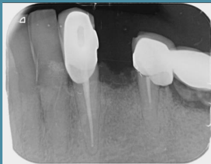
Periapical x-ray scan After extraction and bone grafting

By: Doctors at the Clinic for Oral and Maxillofacial Surgery, Shamir Medical Center