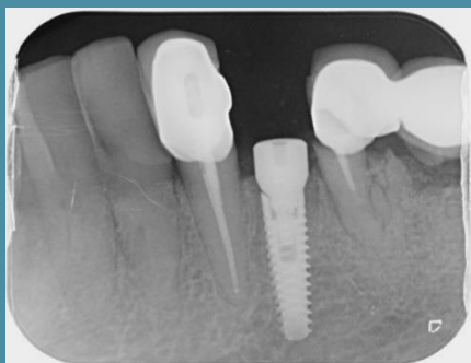
Periapical x-ray scan 4 months post grafting implant placement