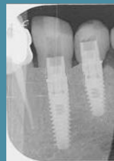
Periapical x-ray scan 4 years post grafting - with crown