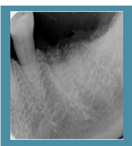
Periapical x-ray scan After extraction and bone grafting (b)