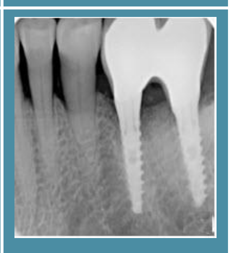
Periapical x-ray scan 4 years after grafting - with bridge