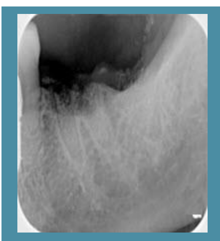
Periapical x-ray scan After extraction and bone grafting (a)