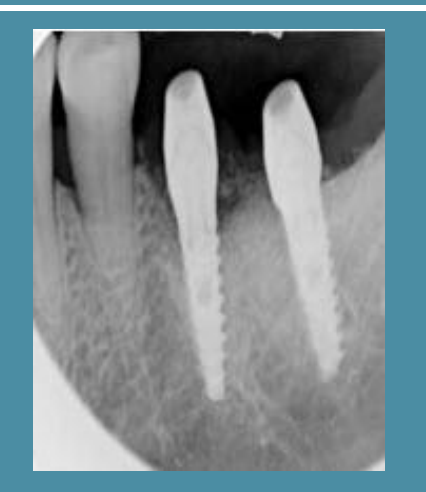
Periapical x-ray scan 4 months post grafting - implant placement