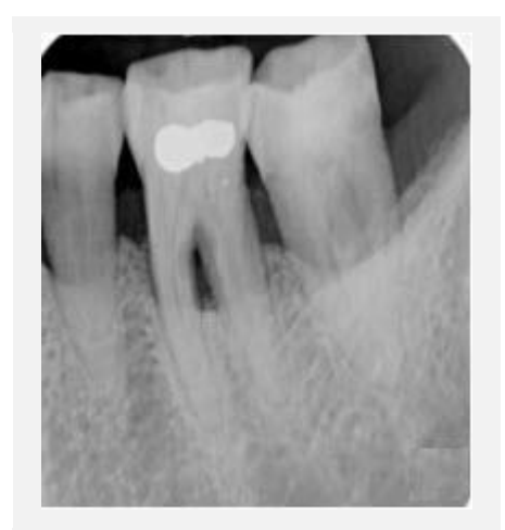
Periapical x-ray scan Before extraction and bone grafting

By: Doctors at the Clinic for Oral and Maxillofacial Surgery, Shamir Medical Center