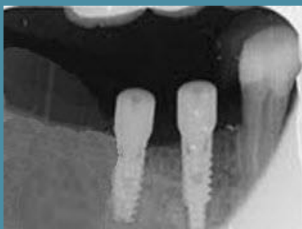
Periapical x-ray scan 4 months post grafting - implant placement