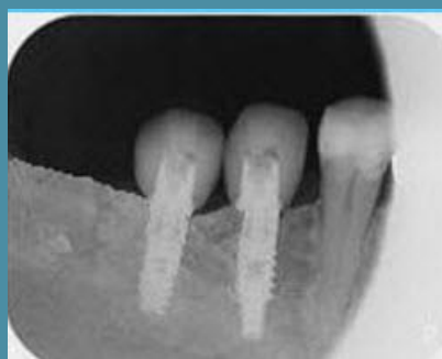
Periapical x-ray scan 4 years post grafting - with crowns