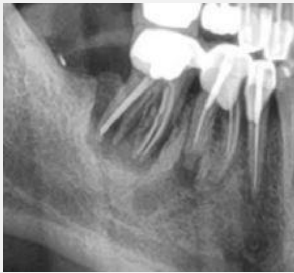
CBCT scan Before extraction and bone grafting