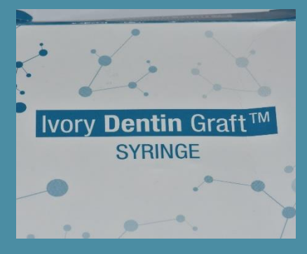
Ivory Dentin Graft