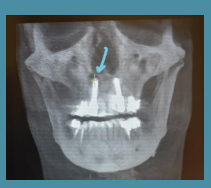
CBCT scan (Axial)